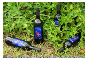
Free-range wines foraging in the wild

Sadly, these practices have become so commonplace in the industry that they are now fully accepted. However, a small band of conscientious wineries, wholesalers and pubs are battling to bring consumers Free-Range Wines that are permitted to forage freely in the vineyards. These wines are gently gathered whilst slumbering, then shipped uncorked in a roomy pen where they freely associate with others of their kind. At PJ's we proudly stock only free-range, humanely treated wine . We welcome you to taste the difference!