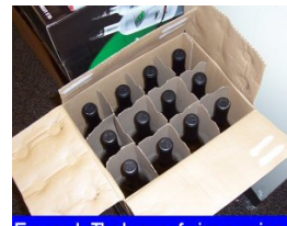
Exposed: The horror of wine penning

"It is our sad duty to bring to light a particularly hideous practice that goes on behind the gloss of the retail wine business. A practice so cruel, so inexplicably wanton, we're sure it will trigger a firestorm of consumer outrage that will be felt from Niagara to New Zealand. We're speaking here of the scurrilous practice of bottle engorging and wine penning .